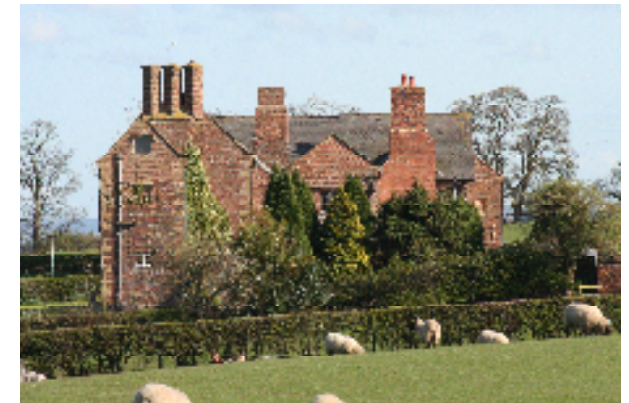
St Deiniol's Ash Farm