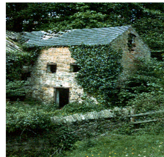
Old Corn Mill

This is a largely wooded walk which skirts the Castle parkland and private Hawarden Estate, crossing a stream near the ruined corn mill. Following the long straight track to Cherry Orchard Farm, the path returns via a quiet roadway, rising above the by pass to give good views of surrounding countryside. The final stage, curving round past the estate woodland and rejoining Tinkersdale along its bend, completes its course at the car park.