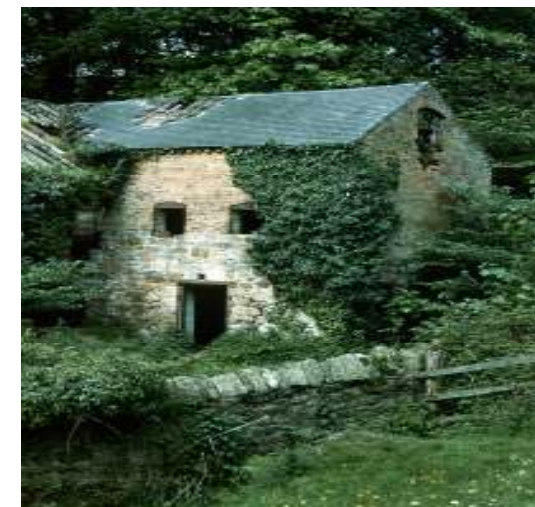
Old Corn Mill

This is a largely wooded walk which skirts the Castle parkland and private Hawarden Estate, crossing a stream near the ruined corn mill. Following the long straight track to Cherry Orchard Farm, the path returns via a quiet roadway, rising above the by pass to give good views of surrounding countryside. The final stage, curving round past the estate woodland and rejoining Tinkersdale along its bend, completes its course at the car park.